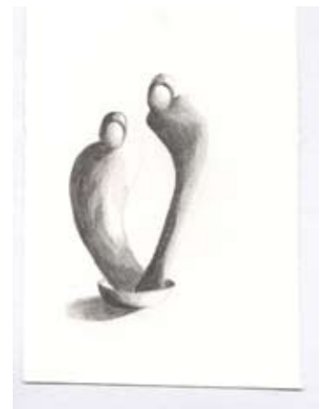
She Looked in and saw her destiny (selected works) Mixed media, dimensions variable